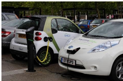
Plugged-in places, Milton Keynes